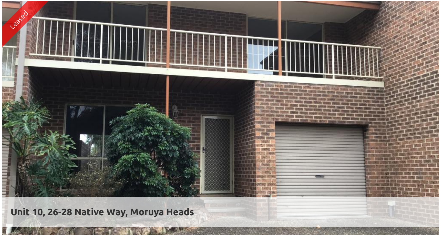
Unit 10, 26-28 Native Way, Moruya Heads