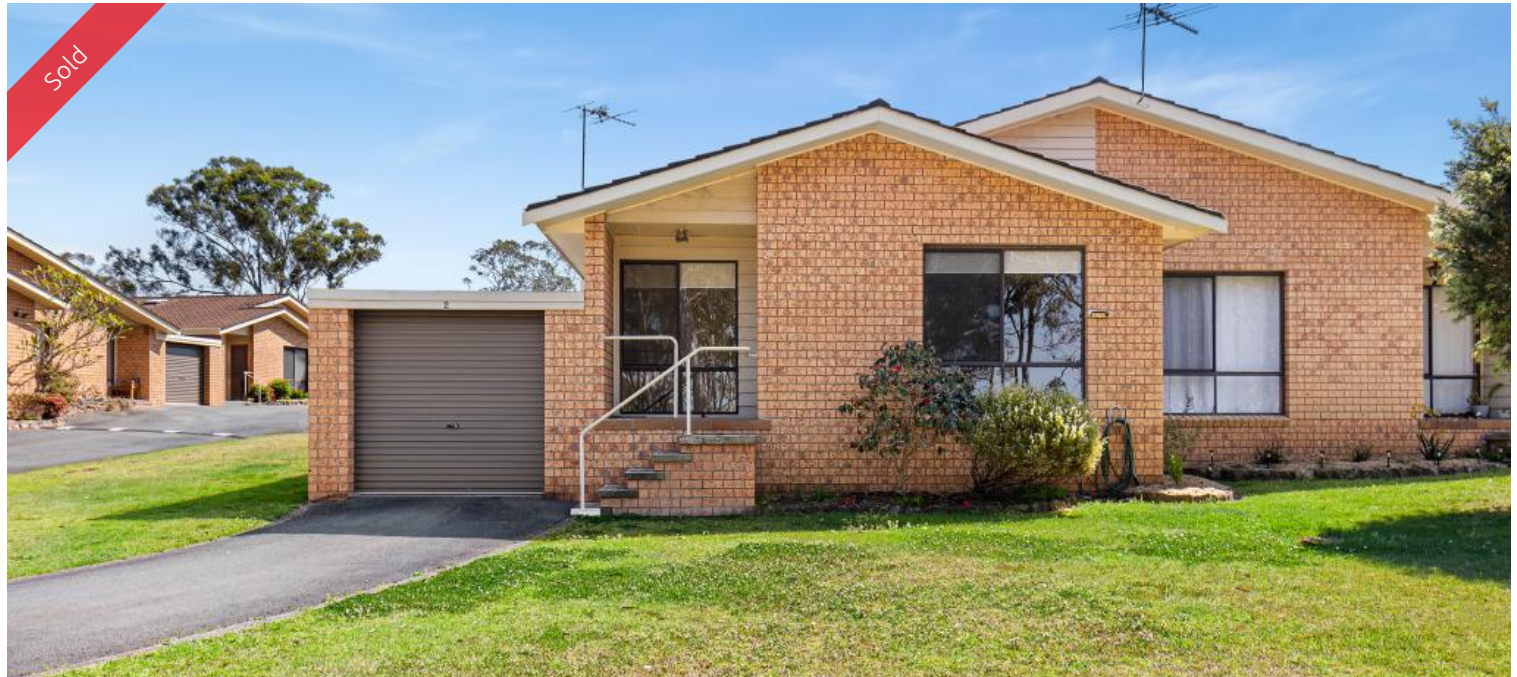
Unit 2, 28 Anderson St, Moruya