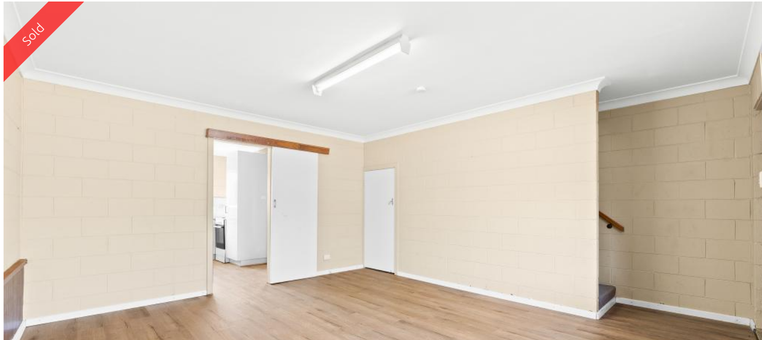
Unit 13, 67 Evans St, Moruya