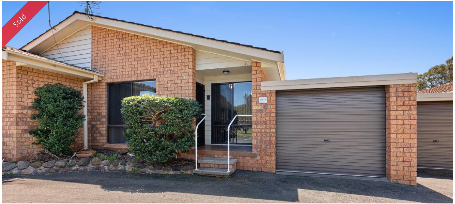
Unit 18, 28 Anderson St, Moruya