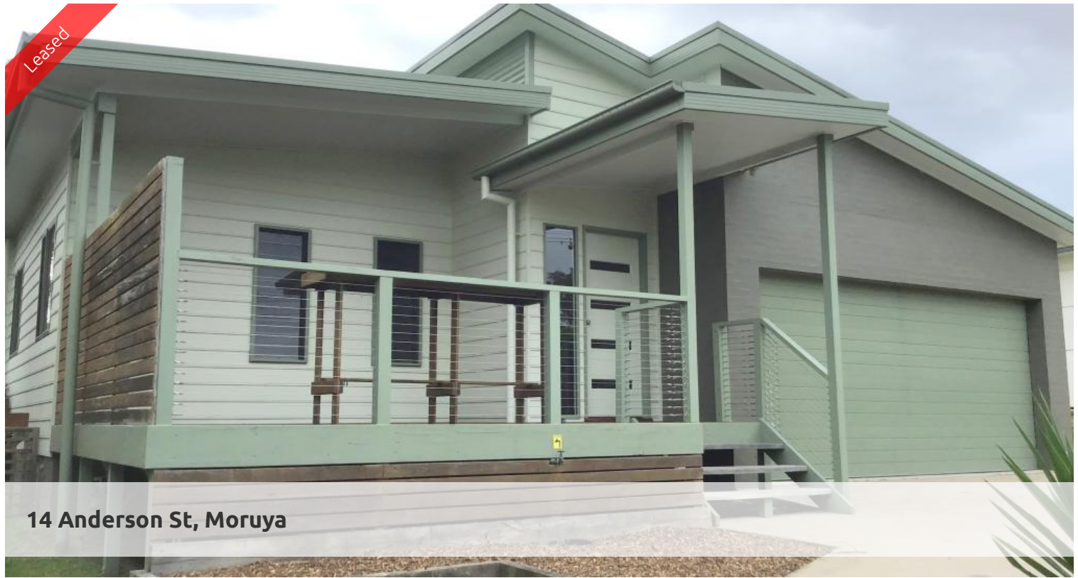
14 Anderson St, Moruya