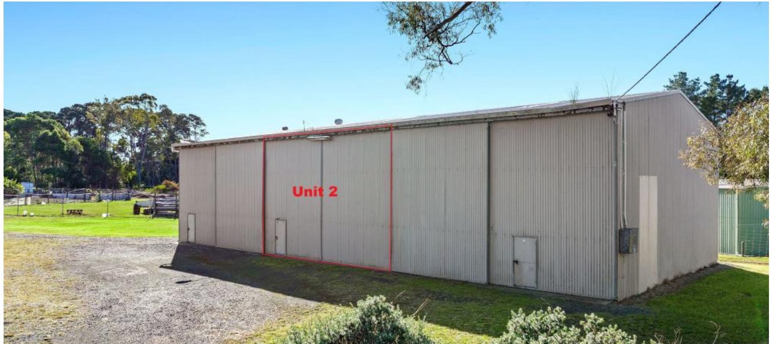
Unit 2, 17 Sherwood Rd, Bermagui