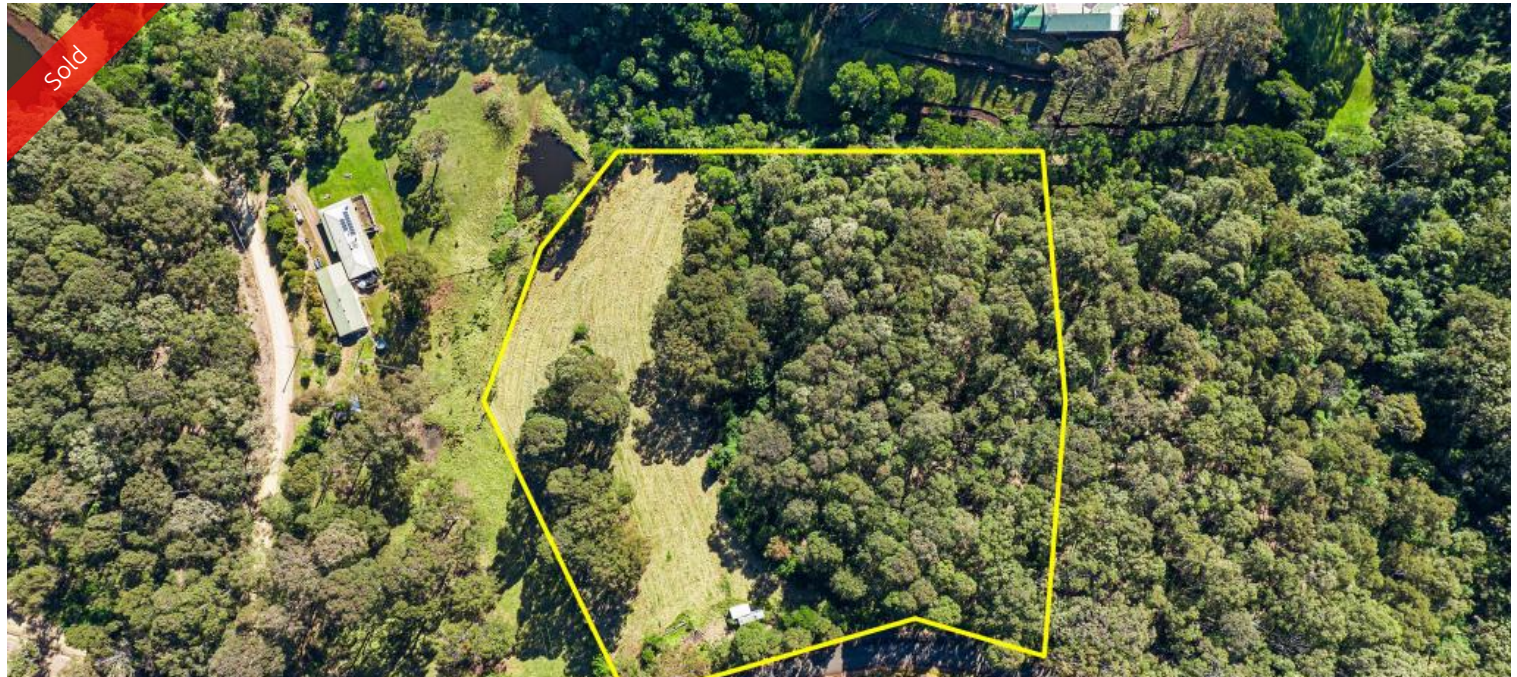
LOT 7 Ridge Rd, Central Tilba