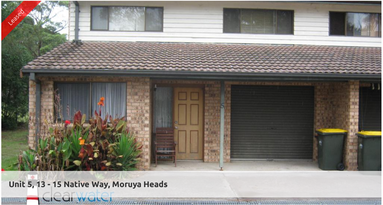
Unit 5, 13 - 15 Native Way, Moruya Heads