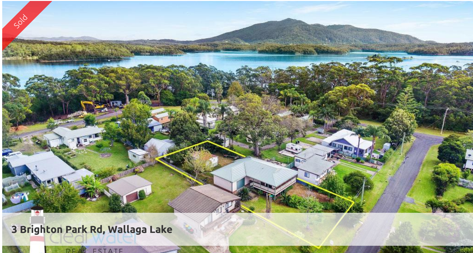
3 Brighton Park Rd, Wallaga Lake