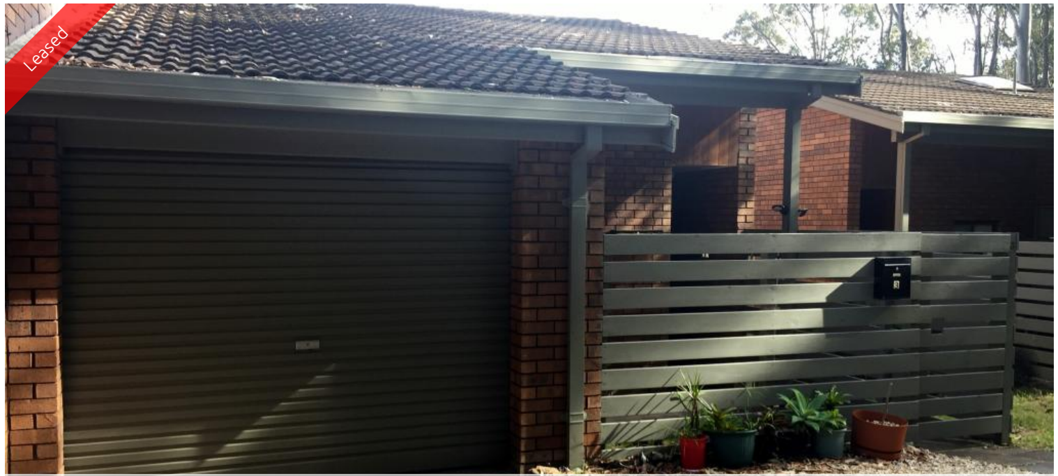
Unit 3, 8 Curt Lane, Narooma